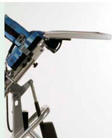
Angle adjustable tray