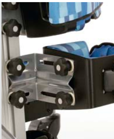
Adjustable chest, hip and knee supports