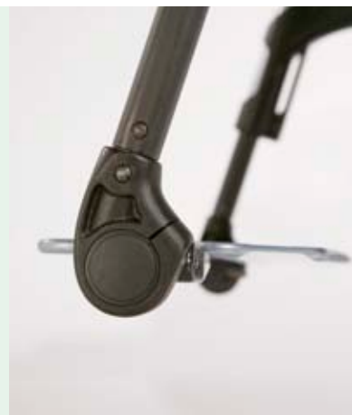
Angle adjustment of the footplate