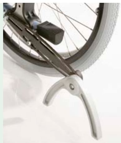
Flexible swinging anti-tipper