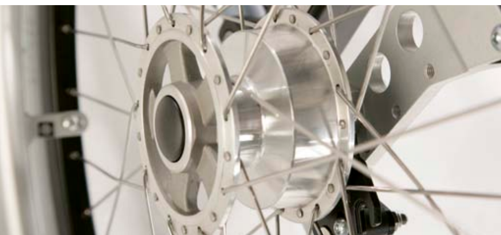
Rear wheel with drum brake system for attendant