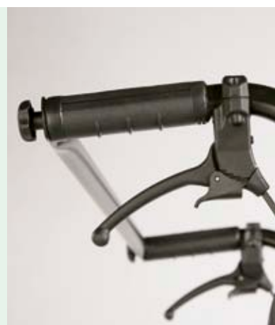
Brake lever for attendant