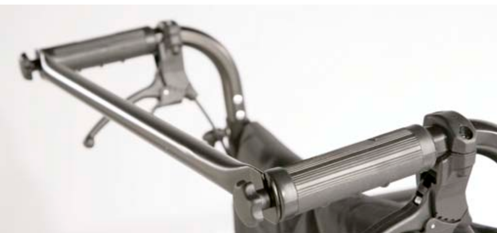
Back stabilizer, increases overall stability and can be swung out of the way for folding