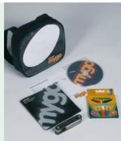
Bag with content