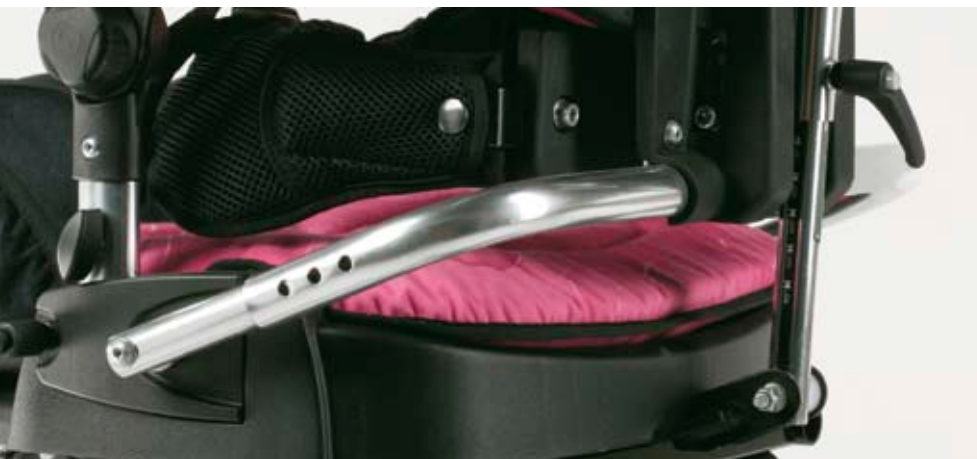
Back angle adjustment