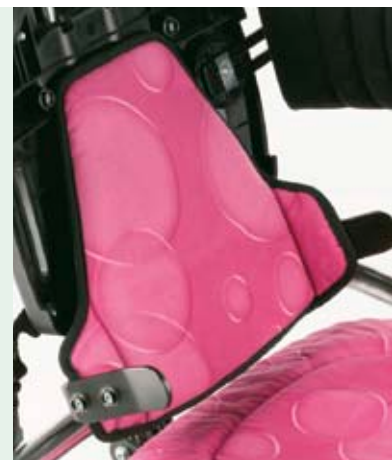
Pushbar (Detachable pushbar)