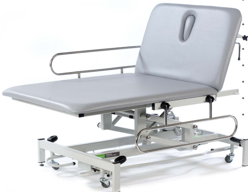
Model 40 with optional chrome side support rails, foot bar switch and paper roll holder

This traditional Bobath Neurology Couch has been designed for neurological assessment and treatment for both adults and children. The couch is extremely strong and rigid, with a large treatment surface to support both the patient and therapist for a wide range of treatment procedures. This couch has a safe working load and lifting capacity of 320kg (704lb / 50 stone) to cater for heavy loads.