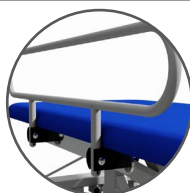
Fold-down Side Support Rails