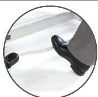
Foot Bar Switch