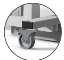
Large Castor Base