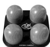
AP216 Deep massage