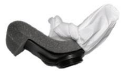
AP230* Drainage Relaxation*