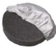
AP212* Soft massage