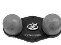
AP223 Lumbar massage