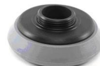
AP229SD Respiratory therapy