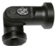
AP 209 FR Percussion adaptor includes 5 disposable covers