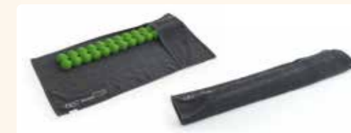
Wrapped around the SPINEFITTER, the Towel reduces the impact on trigger points and enables an even gentler training style.