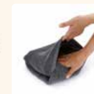
Folded down to pillow size, the Towel can be used as the ideal SPINEFITTER head rest.