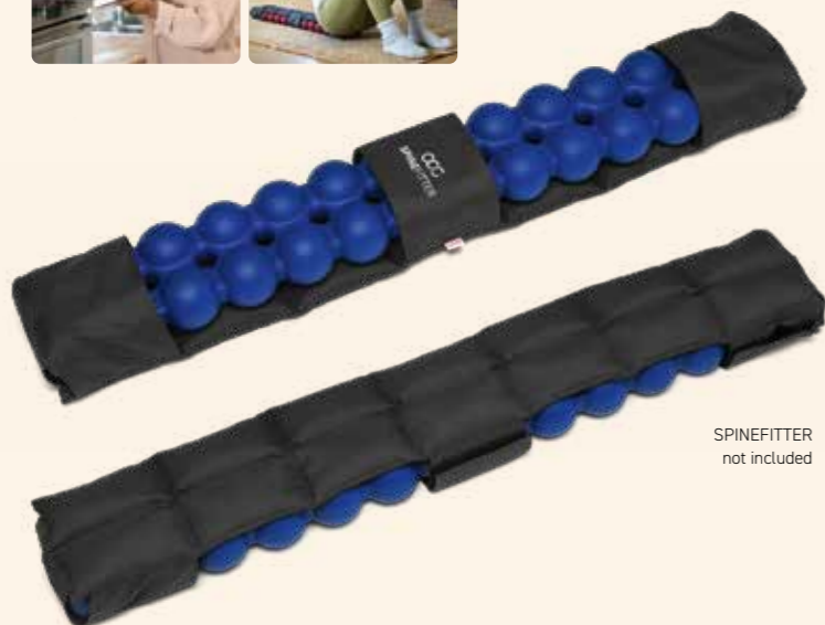
SPINEFITTER not included

with hook-and-loop fastener on both ends for simple insertion of the SPINEFITTER by SISSEL® and the optional Extension Kit